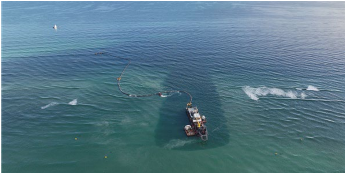
Topsail Inlet 2023-2024